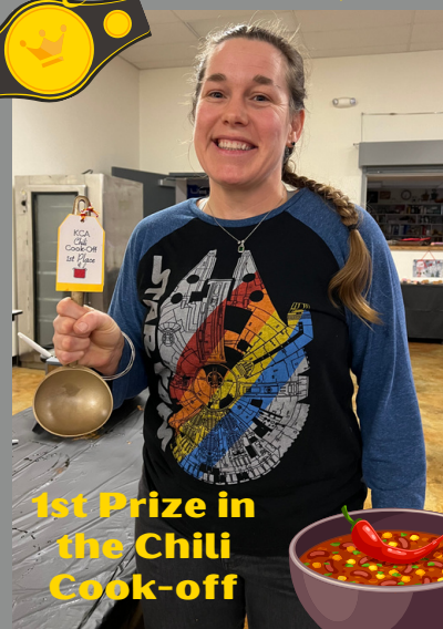
1st Prize in the Chili Cook-off