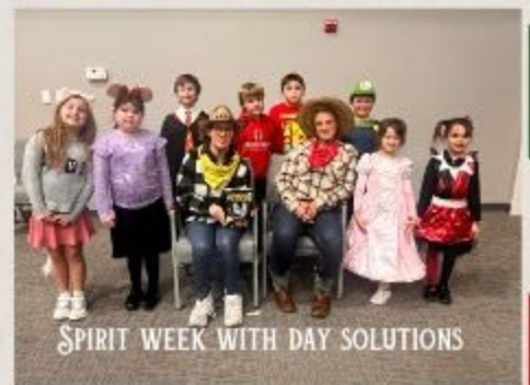
SPIRIT WEEK WITH DAY SOLUTIONS