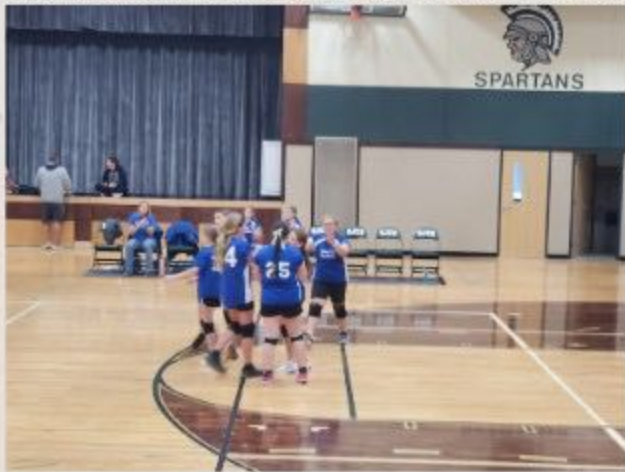
KCA and Saint Peters cheer team