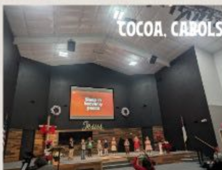
COCOA, CAROLS, & COOKIES