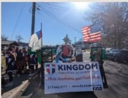
KCA FLOAT IN FULTON CHRISTMAS PARADE